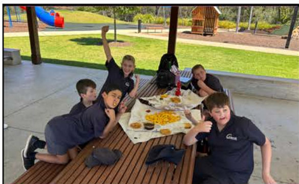
GWYNNE ROOM 2025

The Gwynne Room have started to write their own books, and we are so excited to see their creativity as we work on it over the year.